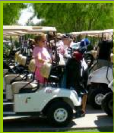
Meet and greet in the staging area

Next Nine & Wine outings: Sun., 2/26 & 3/25