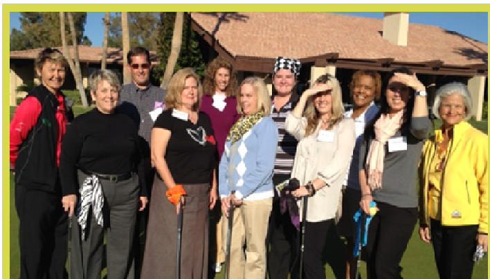
Fun at the Golf Course - The “Mental Mulligans” team at McCormick Ranch Golf Club